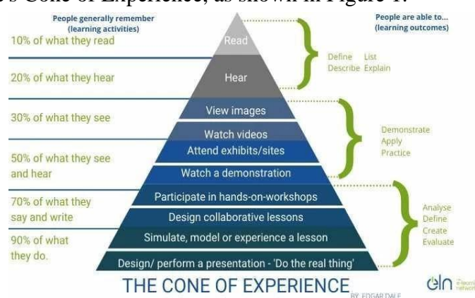
Figure 1. Dale's Cone of Experience

Arsyad [44] argues that teachers should deliver learning by utilizing students' five senses. The optimum use of the five senses to support learning can be simulated in the depiction of Dale's Cone of Experience, as shown in Figure 1.