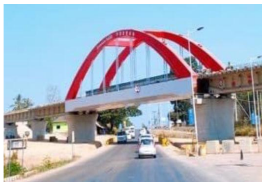
Figure 1. Overpass in Vientiane-Vengung highway

Example 1. The teacher showed an image of an overpass at the Vientiane-Vengung highway with a parabolic shape of 40 m in length and 12 m in height from the bridge deck to the highest peak. Draw a graph and determine the highest point of that overpass (see Figure 1).