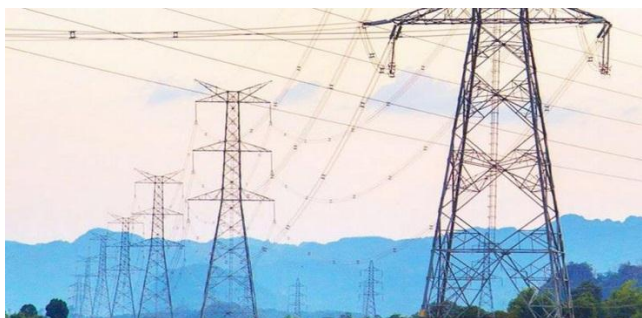
Figure 3. Power grid at Namngum hydroelectric power station

shape of the wire mesh, and find the height from the ground to the lowest point of the wire mesh, rounding the result to the units) (see Figure 3).