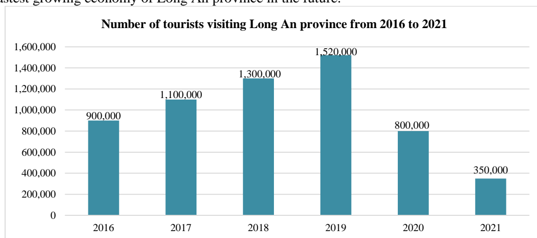
Figure 6. Number of tourists visiting Long An province from 2016 to 2021 (Author's collection, Mar. 15, 2022)

Additionally, Rach Cat Fort should be located in a tourism route planning, which is attached to the development of professional villages in Long An province. A tourism route planning is a scheduled plan for tourists who have an ambitiousness to discover all tourist attractions in a specific place. The linkage of attractions contributes to shaping a complete tourism route to help tourists discover several places at a time. Although promoting local tourism, numerous travelers are still showing their neglect toward Long An tourism. Long An authority should appeal to the investment of private travel agencies to make a breakthrough for Rach Cat Fort preservation and stimulate the development of tourism. The authority should closely work with the Department of Culture, Sport, and Tourism to make a collective effort in preserving Rach Cat Fort and having this place be on the tourism route of Long An visits. Likewise, it is crucial to combine with professional tourism with the intention of promoting Long An's food specialties to tourists [17]. Asserting Rach Cat and other historical sites' centrality in local tourism is prophesied to offer the fastest growing economy of Long An province in the future.