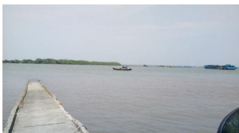
Figure 2. The relic of the old wharf (Source: Author, Feb. 28, 2019)

Historically, Long An authority issues a handful of preservation policies concerning Rach Cat Fort, yet most of them have been not effective in comprehensively and extensively conserving this historical site. The Fort has not experienced a tremendous revamp to serve for preservation and tourism exploitation.