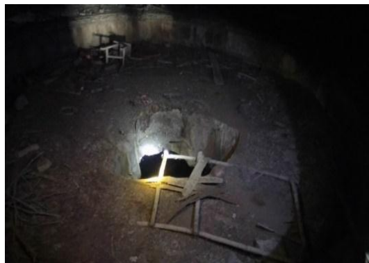
Figure 4. The remaining floating basement under the armament container

Meanwhile, figure 3 and figure 4 unveil that the basement of Rach Cat is suffering severe waterlogging. The site's backyard is undergoing the cavitation of Rach Cat river so that this site is unapproachable. It is implied that it is vital to have some timely solutions issued to hamper the destruction of Rach Cat Fort and promote tourism.