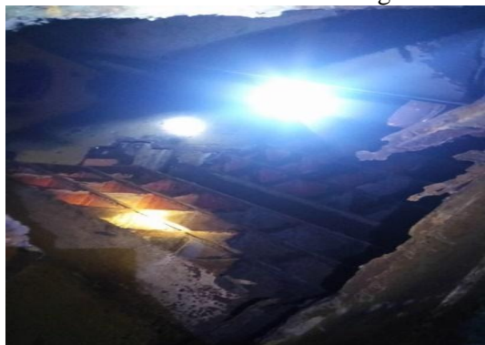
Figure 3. Armament container in the basement

Figure 2 illustrates severe destruction of the wharf while the observation tower has only retained the structure and the housing or military fort has not been intact.