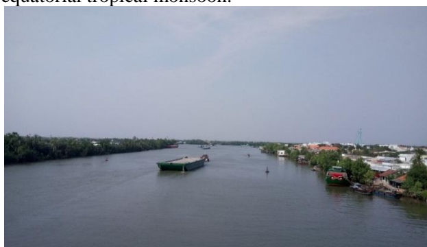
Figure 1. Long Huu island viewed from Kinh Nuoc Man bridge

Rach Cat Fort, located in Long Huu ward, Can Duoc district, Long An province, is covered by water, including three major rivers and 12 provincial rivers, bringing a great deal of alluvium for an advantage of agriculture. Long Huu island has a plain terrain along the Northwest - Southeast axis, enclosed by Vam Co river, Rach Cat river, and Nuoc Man canal [3, p. 12]. Long Huu land lies in the lower land of Can Duoc district. The land is often flooded with alum. Meanwhile, the weather has two seasons, including the dry season and the pluvius season. Thereby, the climate of Long Huu is a sub-equatorial tropical monsoon.