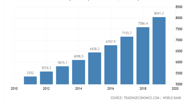
Figure 2. The Gross Domestic Product per capita in Vietnam

A similar conclusion has been drawn after witnessing the exponential increase in the Gross Domestic Product per capita in Vietnam. It last recorded at 8041.20 US dollars in 2019 when adjusted by purchasing power parity (PPP) (Figure 2). This GDP per capita is said to be equivalent to 45 per cent of the world’s average (Trading Economics, 2020). The increasing affluence leads to the rise in people who are willing and able to pay for their education. This is easy to explain in Vietnam, where educational achievement is still among the top priorities in identifying success in life. For instance, over 90% of Vietnamese students studying abroad are self-funded, and the total amount spend on overseas education accounted for roughly 1.71 billion USD in 2013 (International Consultants for Education and Fairs (ICEF) Monitor, 2014).