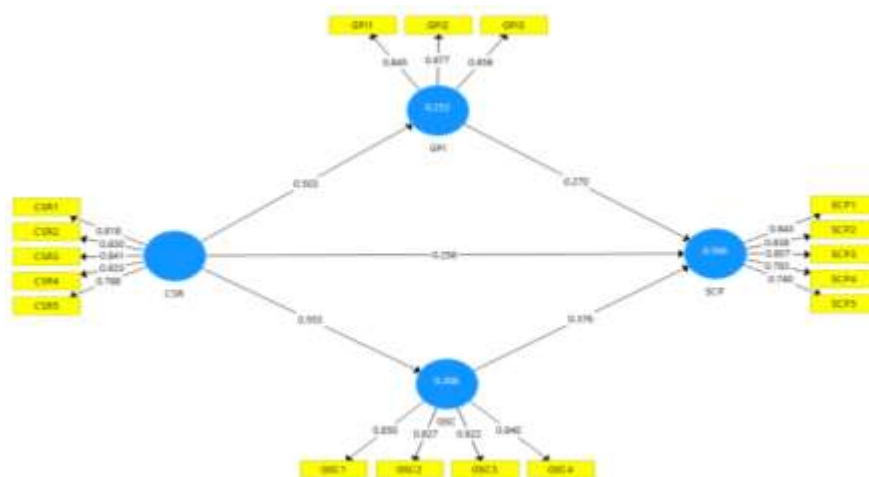
Figure 2: SEM analysis result.