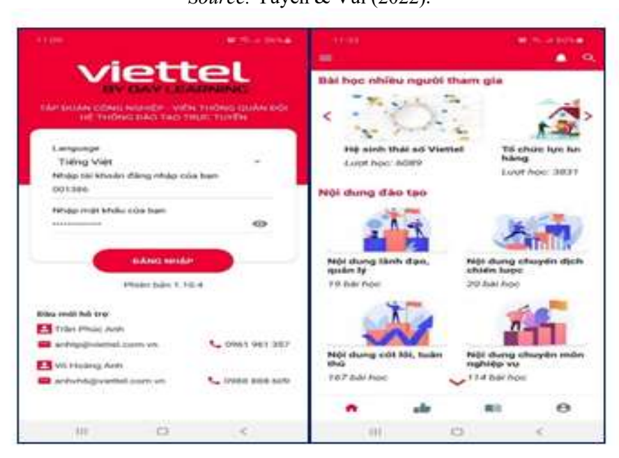
Figure 3: The interface of the BDL application on mobile phones