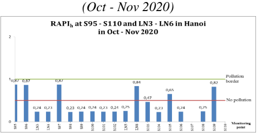
Figure 3. Chart of aggregate assessment of ambient air pollution by RAPI<sub>h</sub> at sites in industrial zones/clusters S95 - S110 and trade villages LN3 – LN6 in Hanoi (Oct - Nov 2020)