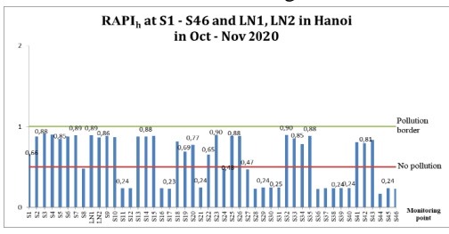
Figure 1. Chart of aggregate assessment of ambient air pollution by RAPI<sub>h</sub> at sites in industrial zones/clusters S1 - S46 and trade village LN1, LN2 in Hanoi (Oct - Nov 2020)

Results of RAPI<sub>h</sub> at 116 monitoring sites in industrial zones/clusters (110 sites S1 - S10) and trade villages (06 sites LN1 - LN6) in Hanoi in Oct – Nov 2020 were illustrated in Figure 1 – 3.