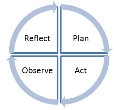
Figure 1. Cyclical action research process

Action research is a useful methodology due to its distinctive characteristics compared to other research methods. Firstly, action research process is a cyclical nature that has four steps: plan, act, observe, and reflect, which is presented as a coherent sequence of activities. This model is based on Kurt Lewin's work, explicated by Kemmis and McTaggart (1988) (Figure 1).